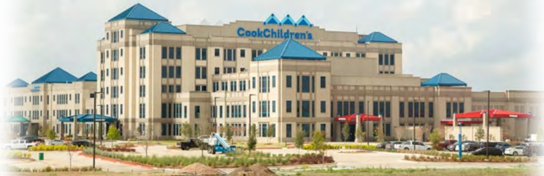
Cook Children's Medical Center Prosper Campus

For over 100 years, Cook Children's has been a trusted leader in pediatric health care in this region.