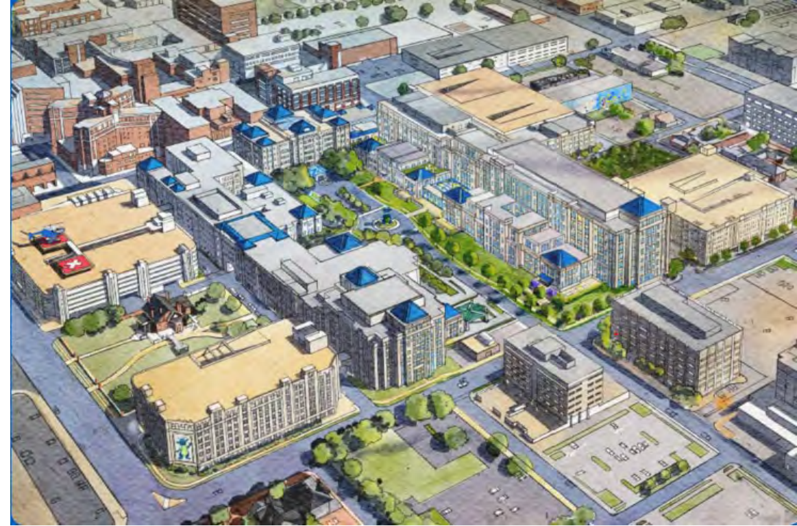
Cook Children's Fort Worth Campus