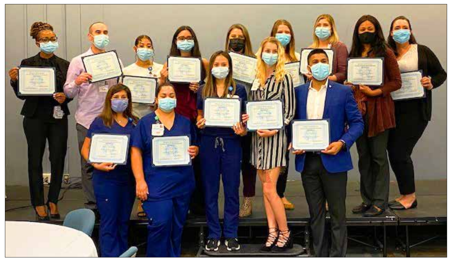
Recent graduates from the Methodist Dallas Medical Center Nurse Apprenticeship Program.