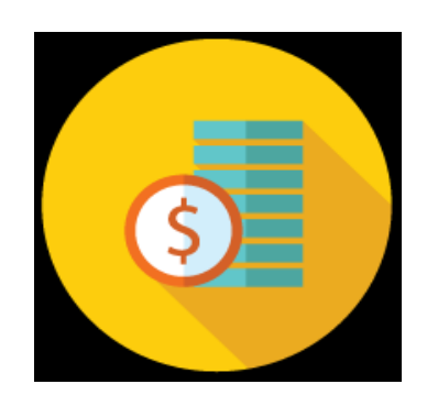
Health Care Savings